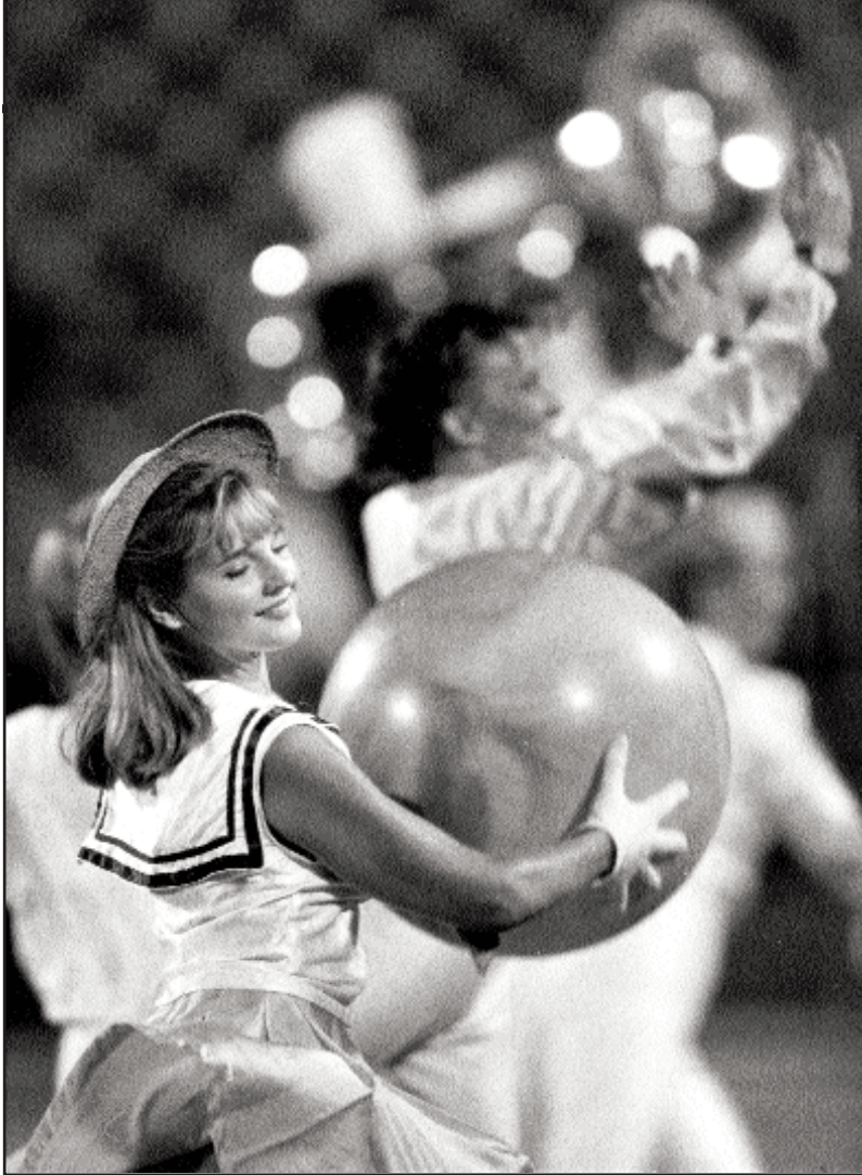
Suncoast Sound, 1988 (photo by Orlin Wagner from the collection of Drum Corps World).

field brass caption, fourth in percussion and a final record-high score of 94.8 to complete the best year in their history, and yes, edging ahead of Spirit.