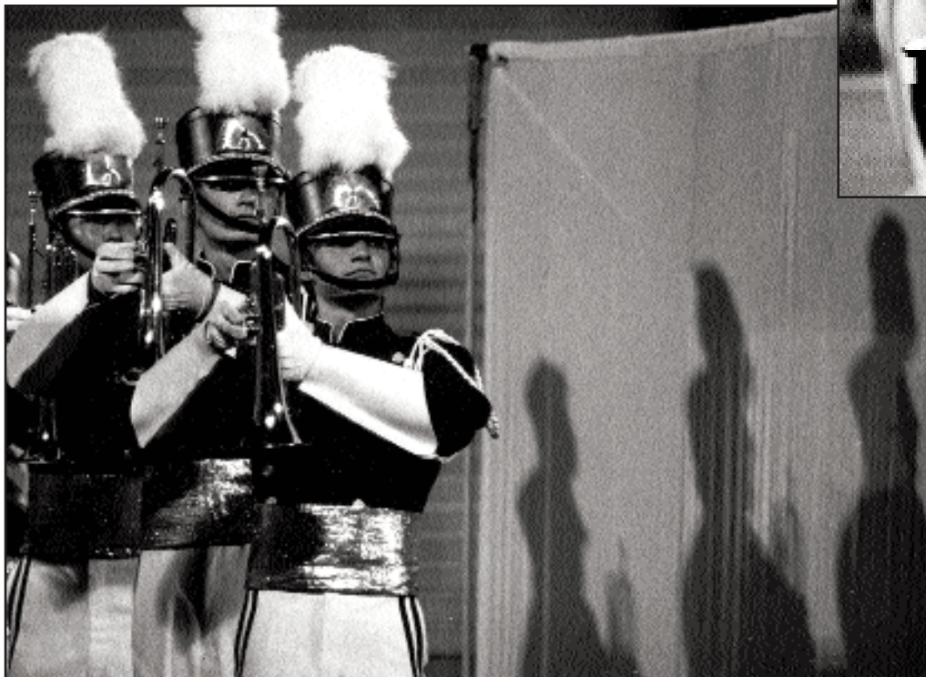
Suncoast Sound, 1988.

This was the year it seemed that Suncoast Sound spent the last of their energy and money, leading to the end. Unfortunately, the history of Suncoast Sound as an open class drum corps would end with the 1989 season.