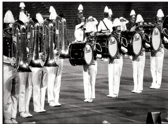
Suncoast Sound, 1985, at DCI in Madison, WI (photo by Donald Mathis from the collection of Drum Corps World).

The troubles of the winter showed in the early season. Although a determined group, the quality slipped to 1982 levels. The scores were just into the 50s in early July. The competition was greater as well, as Suncoast watched former lower level corps topping them. Even in-state rival Florida Wave beat Suncoast.