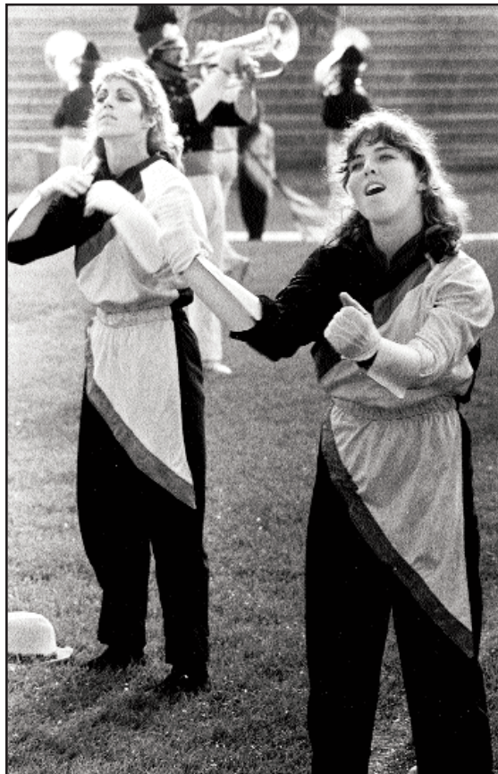
Suncoast Sound, 1982, The Greatest Love of All with sign language.

with its tribute to the Viet Nam era that was very popular. The staff was experienced and led to the continuation of the success for the organization. The corps played Six O.S. , Aquarius , Requiem , Satisfaction and America the Beautiful .