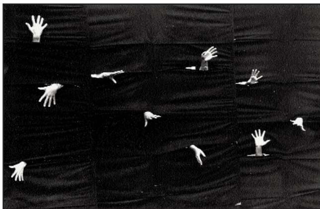
Suncoast Sound, 1987 (photo by Orlin Wagner from the collection of Drum Corps World).

In 1987, Suncoast took their "sunjazz" one step further by performing excerpts from another Stan Kenton book, an adaptation of the Broadway all-time favorite, "My Fair Lady." The field production, "My Fair Lady . . . Our Way!" was one of the year's real crowd-pleasers.