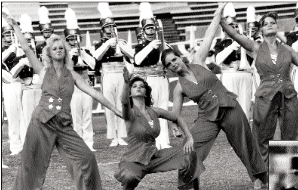
Suncoast Sound, August 17, 1993, at DCI in Jackson, MS.

year, but now Suncoast was on top for good. When quarterfinals came, they easily made the top 12, finishing in 10th place and moving up to a solid ninth place at finals. This ended one of the greatest comebacks for a corps in DCI history.