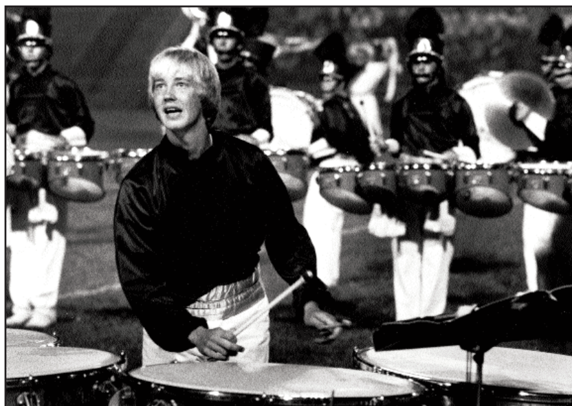
Suncoast Sound, approximately 1985.

When Allentown came around, Suncoast finished four points below North Star. Suncoast Sound thought they were robbed. Their score jumped into the 70s mid-season, narrowing the gap on Spirit. July 29 had the