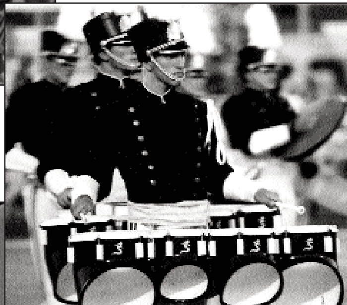
Suncoast Sound, June 29, 1995 (photo by David Rice from the collection of Drum Corps World).

the corps began. Two organizations -- the Suncoast Sound Cadets and Suncoast Gold -- were formed under the Suncoast "umbrella" to ensure the organization lived on.